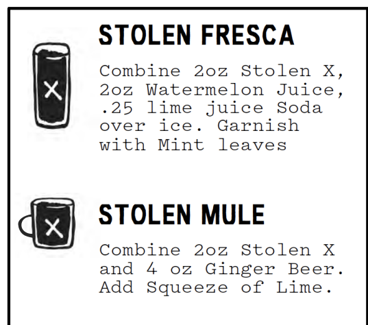
DRINK MENUS & RECIPES